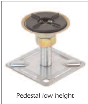
Pedestal low height