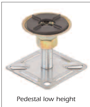
Pedestal low height