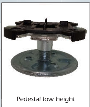
Pedestal low height