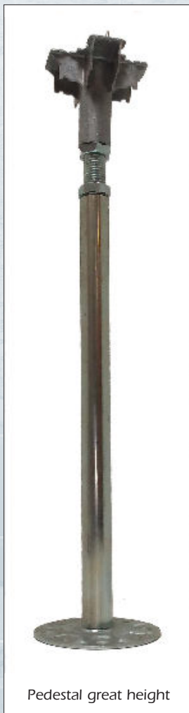
Pedestal great height